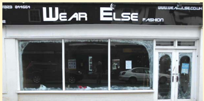
Shop front before (above) and after (below).