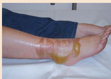
Scalding due to hot water spill in a restaurant

Amend the Reporting of Injuries, Diseases and Dangerous Occurrences Regulations 1995, by extending to seven days, the period off work before an injury or accident needs to be reported.