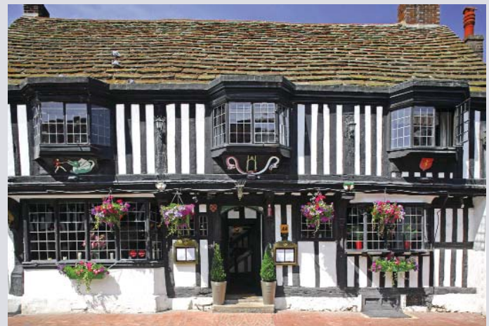
The venue for the Business Breakfast, The Star at Alfriston.

If you would like to attend please register your interest by email to: E_regeneration@wealden.gov.uk T. 01892 602886 and pay £10 cash on the day.